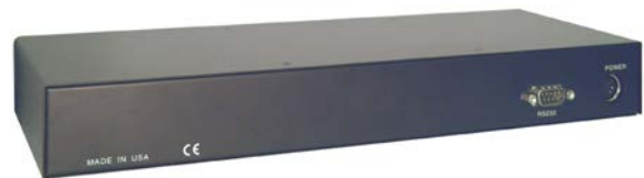
Rearview of (All models)

■ Phone: 281-933-7673 ■ E-mail: sales@rose.com ■