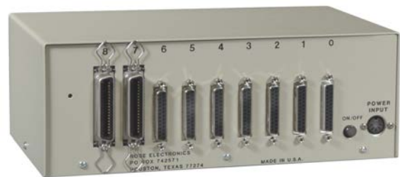
Rearview - model SS-9

** Each parallel port is programmable as a computer port or printer port