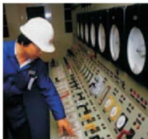
Connect up to 9 peripherals

The units can be daisy-chained for expansion. The versatility of the SuperSwitch makes it a practical investment for the budget-conscious.