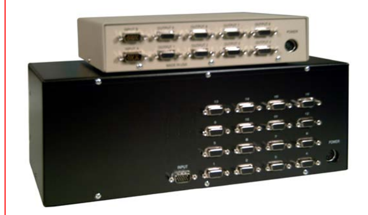
VSP-2X8VB model (top) / VSP-1X16VB model (bottom)