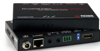
CrystalView HDMI 4K60 HDMI extender over CATx cabling

WWW.ROSE.COM ▪ sales@rose.com ▪ (800) 333-9343