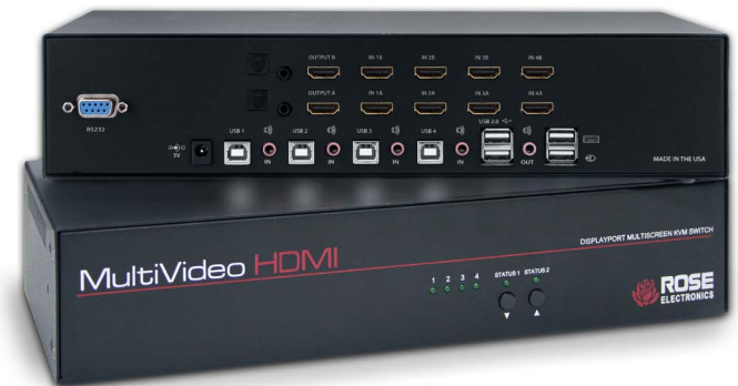
MultiVideo HDMI 1x4 Multi-head HDMI KVM switch