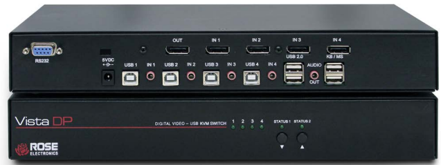
Vista DP 1x4 DisplayPort KVM switch