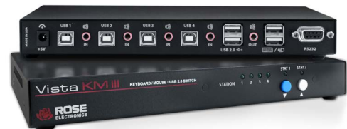
Vista KM III 1x4 HDMI KM switch (no video)