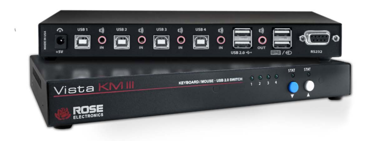
Vista KM III 4 port switch