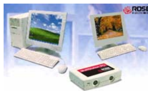
Two independent users share a single computer

In a network environment, all users have their own, unique network identities and share the common network adapter.