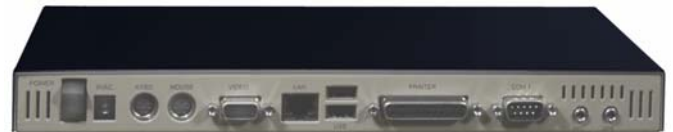
User module (Rear)