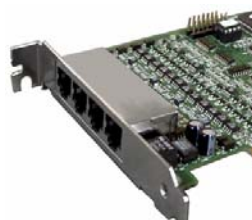
Connects four users using industry standard CATx cable

In a network environment, all users have their own, unique network identities and share the common network adapter.