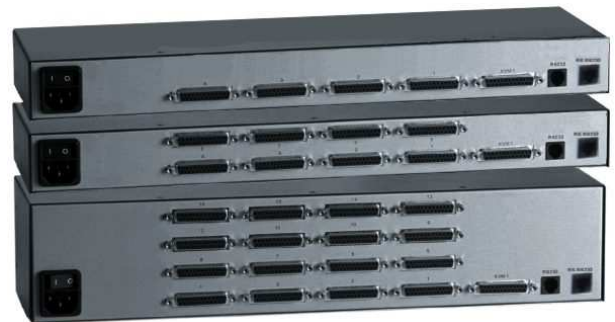
Rear view of UltraView Remote

■ Phone: 281-933-7673 ■ E-mail: sales@rose.com ■