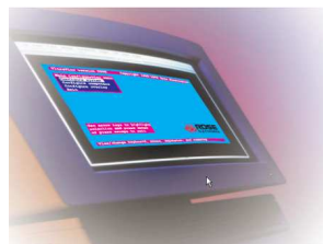
UltraView Remote on-screen menu

With its ability to access your computers and servers locally or over IP, its advanced on-screen menu system, built-in security, flash memory, easy expansion, and other features you start to get a sense of the advantages and applications that the UltraView Remote can provide..