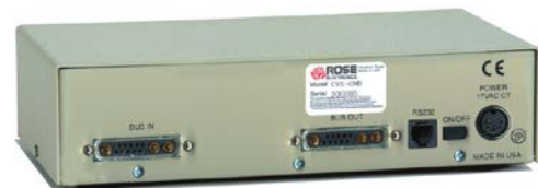
Rear view of ClassView model CVT

■ Phone: 281-933-7673 ■ E-mail: sales@rose.com ■