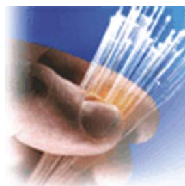
Fiber makes extended distances easy to reach

If your system requires dual video, the CrystalView DVI Plus dual video model can fully support it. A serial and audio model is available which can extend your serial devices, speakers and microphone up to 1,300 feet.