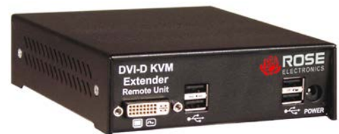
Rear View single / dual Link – single Video – USB 2.0