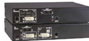
Dual Port USB Model

Phone: 281-933-7673 · E-mail: sales@rose.com ·