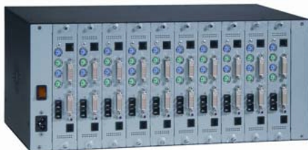
10 Unit Rack

Rack Assembly: The CrystalView Pro fiber can be ordered in a 10-unit rack assembly. (PS2 model only)