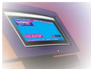
UltraView Pro on-screen menu

With its advanced on-screen menu system, built-in security, flash memory, easy expansion, front panel controls, and other features you start to get a sense of the UltraView Pro advantage.