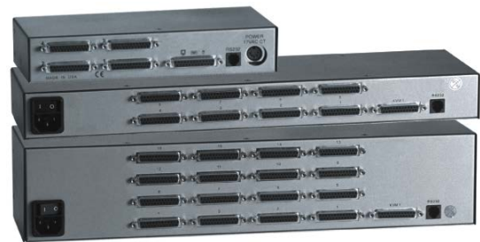
Rear view of UltraView Pro, 1x4 top, 1x8 middle, 1x16 bottom

■ Phone: 281-933-7673 ■ E-mail: sales@rose.com ■