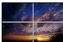
Display a video source across four displays

UltraVista SX maintains the original resolution quality of the input image on all monitors, producing a crisp, clear, perfect image.