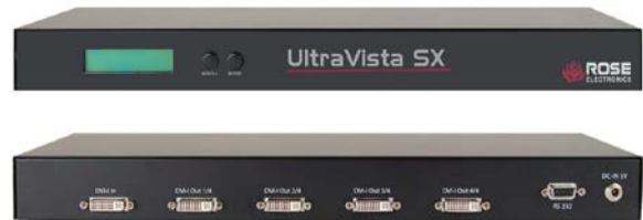
Front / Rear view

■ Phone: 281-933-7673 ■ E-mail: sales@rose.com ■