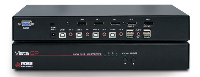
Vista DP 1x4 DisplayPort KVM switch