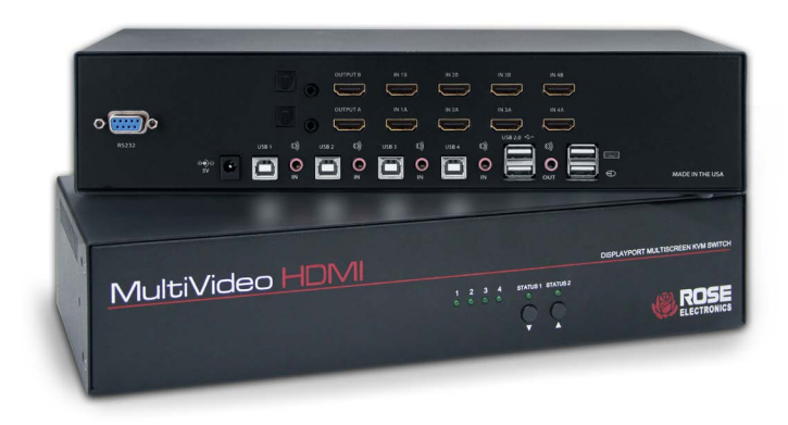
MultiVideo HDMI 1x4 Multi-head HDMI KVM switch