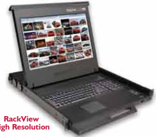
RackView High Resolution