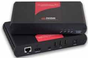
CrystalView EX5 HDMI