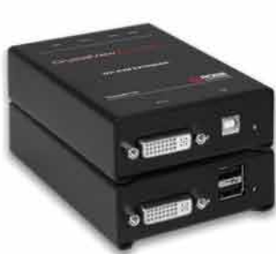
CrystalView DVI Mini

CrystalView EX is point to point and extends up to 1,640' (500m) over CATx CrystalView Extreme is multi-point by using a 1GB Ethernet network for transport CrystalLink USB 2.0 has no video and extends USB 2.0 to 330' (100m) All models have 3-4 high speed USB 2.0 device ports supplying 500ma power USB 2.0 throughput: EX=80 MB/sec; Extreme/CrystalLink=480 MB/sec CrystalView audio at host via USB and at remote via 3.5mm headphone/mic jacks