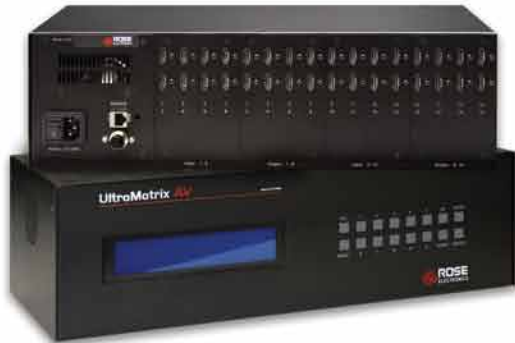
UltraMatrix AV HDMI 16 x 16

Supports USB3.0 throughput up to 5Gbps Industrial locking connectors for USB and power Uses one duplex LC multi-mode fiber Integrated 2-port USB hub Plug-and-play product, no drivers or jumpers