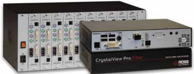
CrystalView Pro Fiber Rack

CrystalView DVI Fiber model extends compressed video at 1920x1200 to 1,300' (400m) over multi-mode and 33,000' (10km) over single-mode cable PS/2 or USB keyboard/mouse, local port, optional serial, stereo speakers, and microphone CrystalView DVI Plus extends uncompressed video either single-link DVI at 1920x1200 or dual-link DVI at 2560 x 2048 to 1300' (400m) over multi-mode cable USB keyboard/mouse, optional USB 2.0, serial, stereo speakers, and microphone