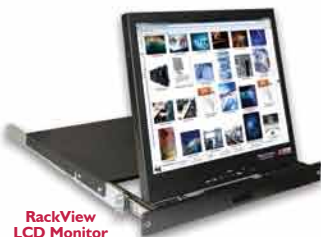
RackView LCD Monitor