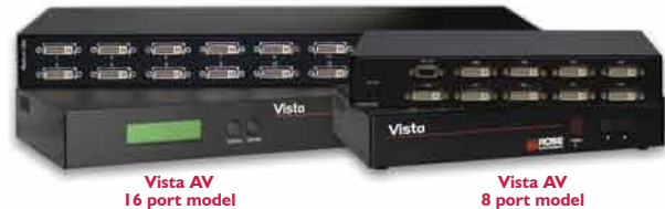
Vista AV 16 port model