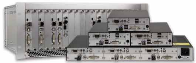
Orion XTender 21 card chassis

Single-link DVI model: one multi-mode fiber, resolution up to 1920x1200 at 1,000' (300m) Dual-link DVI model: two multi-mode fibers, resolution up to 2560x2048 at 1,000' (300m) CrystalLink extends USB 2.0 only, multi-mode to 1,640' (500m), single-mode to 33,000' (10km) Four high speed device ports supply 500ma power and throughput of 480 MB/sec DVI Micro models are multi-mode with SC connectors, CrystalLink model uses LC connectors DVI EDID information can be learned and saved from any monitor