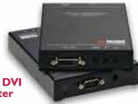
VGA to DVI Converter

Simplifies operation of your KVM switches or other equipment Two styles - 1: Pushbuttons for either a 1U rack or external mounting and 2: Keypad/Stick Pushbuttons have a serial port which connects to a compatible KVM switch and are used exclusively to switch a port on a KVM switch Keypads/sticks have PS/2 or USB ports which are connected in-line with the keyboard and are programmable to send any sequence of keys from a single press