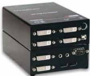
CrystalView DVI Fiber

EX5 Quad model extends uncompressed video of up to 1920x1200 to 330' (100m) USB keyboard/mouse + 3 ports of high-speed USB 2.0 supplying 500ma power Optional dedicated audio serial channel or Windows USB Media DVI Quad model extends compressed video of up to 1920x1200 to 400' (120m) Both USB and PS/2 keyboard/mouse, local ports for remote or local access Optional serial and stereo speakers/microphone and fiber optic link interface