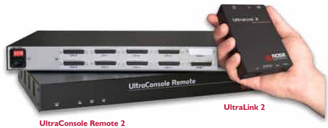
UltraConsole Remote 2