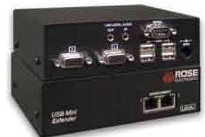
CrystalView Mini USB