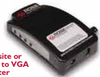
Composite or S-video to VGA Converter

Resolution up to 1920x1080 DVI female in, HD15 male out HDCP compliant Optional external power