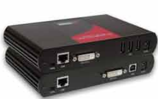
CrystalView EX5 DVI