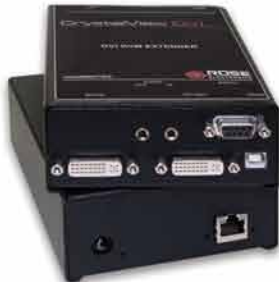
CrystalView DVI CATx