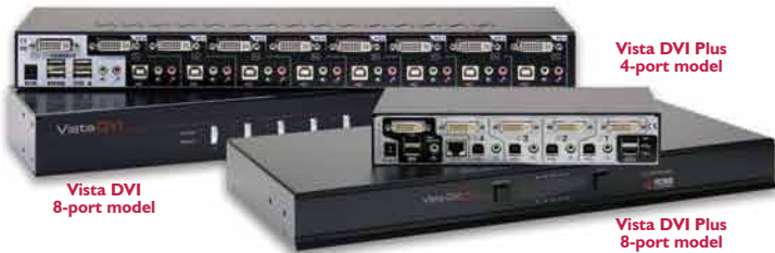
Vista DVI 8-port model