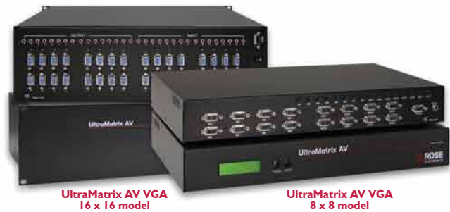
UltraMatrix AV VGA 16 x 16 model