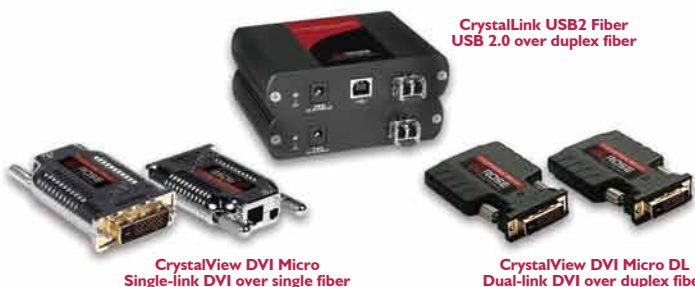
CrystalView DVI Micro Single-link DVI over single fiber

Separate models for PS/2 or USB keyboard/mouse Supports DVI and VGA video at resolutions up to 1600x1200 (1920x1200 option) Multi-mode models extend up to 1,640' (500m) over OM3 cable Single-mode models extend distance up to 33,000' (10km) Optional audio and serial extension Rack can hold up to 10 CrystalView Pro fiber transmitters or receivers