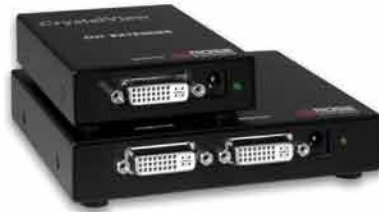
CrystalView DVI Multi

Resolution up to 1920 x 1200 Models available with 2, 4, or 8, or outputs, VGA model can be ordered with 16 outputs VGA unit has HD15 connectors, DVI model has DVI connectors VGA unit has blanking control and optional 2nd input switchable from front panel DVI model will switch both analog VGA and digital DVI Units can be cascaded to gain more outputs