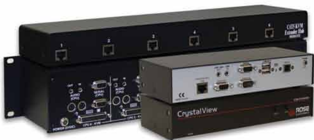
CrystalView CATx Rack

Separate models support PS/2 or USB keyboard and mouse Two video settings for configuration based on cable length USB model supports USB 1.1 peripherals and has integrated 4-port USB hub Optional stereo speakers, microphone, and serial extension Optional dual-head video feature