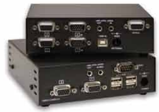
CrystalView Plus USB