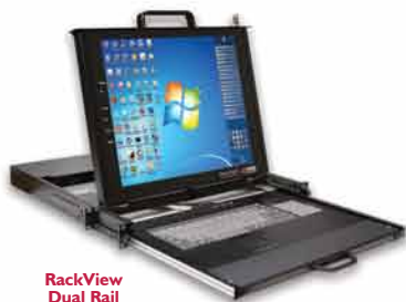
RackView Dual Rail

Resolution up to 1920x1200 - VGA or DVI USB keyboard/mouse interface On-screen menu for easy adjustments Optional KVM switch, audio, trackball, Apple/Sun/international keyboard layout, SDI, HDMI, composite, S-video, DC power