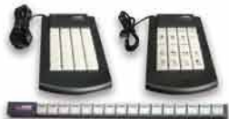
Remote Control Keypad and Stick

Resolution up to 1920x1200 Monitor can be up to 220' (65m) away Local port on transmitter unit allows viewing video at source Small receiver unit is installed for each monitor EDID read from local monitor is stored in flash memory Compatible with all DVI sources