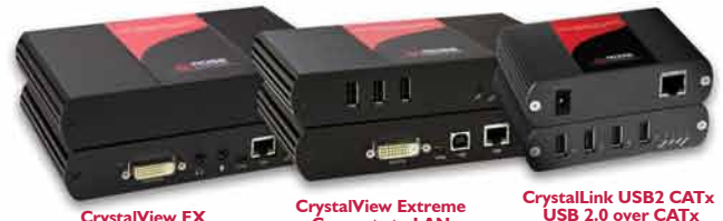
CrystalView EX Up to 1640'

Uncompressed video resolution up to 1920x1200 Extends video and USB 2.0 up to 330' (100m) HDMI model supports 36-bit color and CEC/HDCP pass-through Both models have 3 high speed USB 2.0 device ports supplying 500ma power USB 2.0 throughput of up to 30 MB/sec Audio support via USB or HDMI