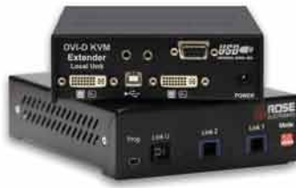
CrystalView DVI Plus