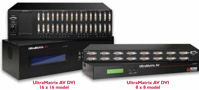
UltraMatrix AV DVI 16 x 16 model

Video resolution up to 1920x1200 2, 4, 8, or 16 in to 1 output Switch from front panel push buttons, serial commands, or optional infrared DVI output is capable of driving cable lengths up to 25' (7m) Front panel display indicates the active selection Built-in DDC learning mode simplifies operation