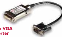
DVI to VGA Converter

Resolution up to 1920x1200 HD15 male in, DVI female out HDCP compliant Built-in OSD function simplifies setup