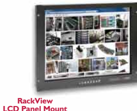
RackView LCD Panel Mount