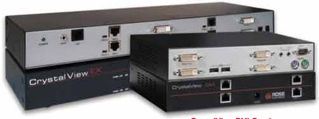
CrystalView EX5 Quad

DVI Mini model extends uncompressed video at 1920x1200 up to 130' (40m) and can be ordered with a USB 2.0 option, keyboard and mouse is USB only DVI CATx model extends compressed video at 1920x1200 up to 400' (120m) Either USB or PS/2 keyboard/mouse, local port for remote or local access Optional serial and stereo speakers/microphone Both models offer optional dual-head video