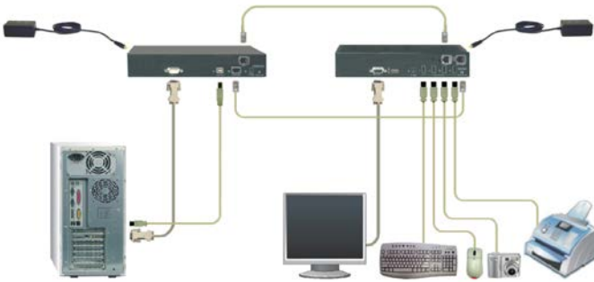
Single, Dual or Quad video <<< USB Devices >>>

Depending on your model, cables and rear panel connectors will vary. Dual and Quad models connect with additional video cables and CAT5 cables.